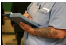
Photo Gallery: Taking Torah to the Cell Block